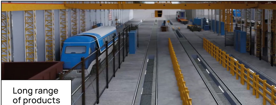
Long range of products