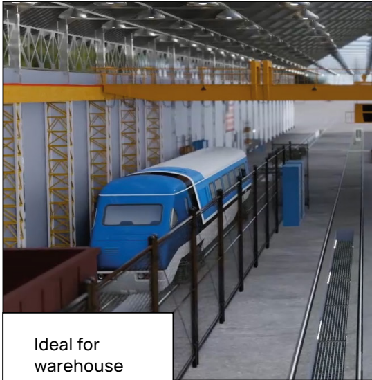
Ideal for warehouse