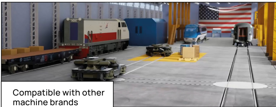
Compatible with other machine brands