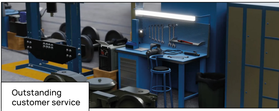
Outstanding customer service

With a focus on durability, reliability, and performance, our equipment is trusted by the railway industry worldwide.