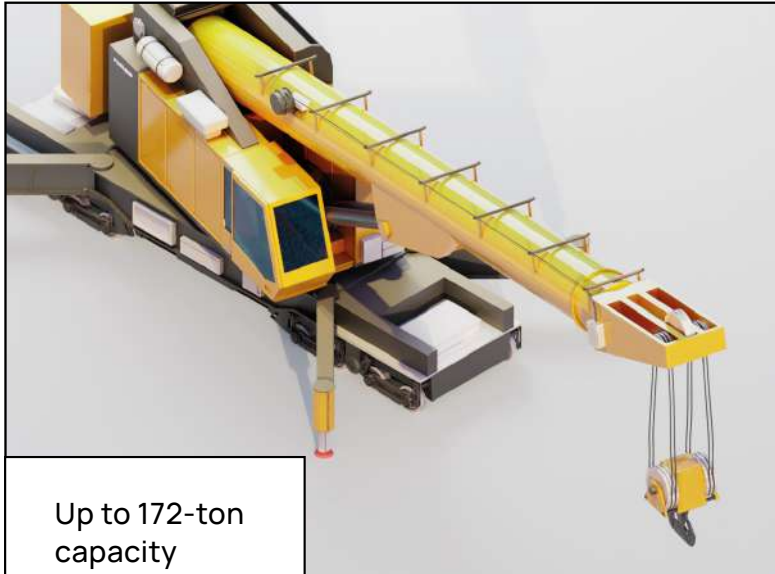
Up to 172-ton capacity